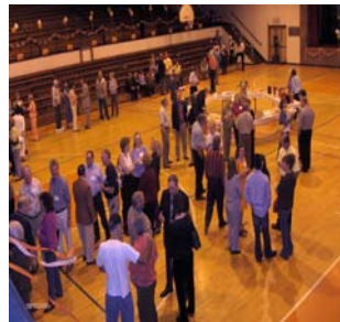
MHSAA had a 2005 Homecoming Reunion in October. A spaghetti dinner was held from

5pm to 6 in the cafeteria that was catered by Fazoli's in Rivergate.