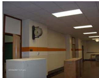
MHSAA West Wing Hall